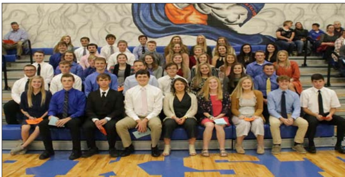
The 2019-2020 Members of the National Honor Society.

While involved in the National Honor Society, members will participate in three service projects per year. The first project involves helping the school. NHS members are required to clean up after home sporting events. The second project involves helping the community. NHS members help collect food for the food pantry. The third event is an individual project where NHS members help an individual or group without compensation.